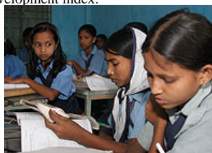
Students in their classroom

Source: 1 Directorate of Primary education, 2,3 BANBEIS, 4 SVRS, BBS