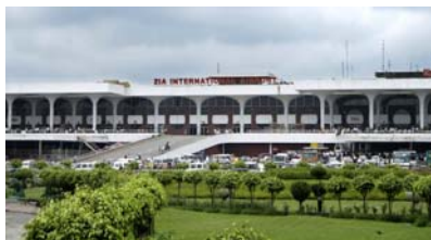
Zia International Airport (ZIA)