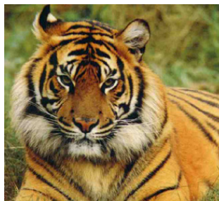
The Royal Bengal Tiger

Bangladesh is bestowed with the bounties of nature. It has a coastline of 66400 km. with Bay of Bengal, World's longest (unbroken 120 km) sea beach at Cox's bazar, world's largest mangrove forest-Sunderban with world famous Royal Bengal Tiger and evergreen hilly areas of Chittagong hill tracts with tribal culture have provoked many tourists from far and near. Dhaka, Chittagong and Sylhet international airport serving International travelers. Peak travel months are November to February.