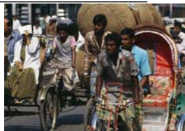
Rickshaw in Dhaka